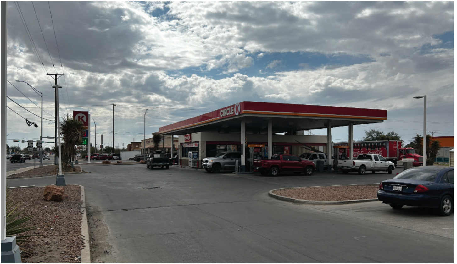
View of property from North Loop Dr. and Horizon Blvd.